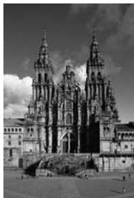
Cathedral of Santiago de Compostela, Spain.

A common inner aspiration to most people taking the Pilgrim's Way to Saint James is that, for one reason or another, they will become somewhat better or healthier, either at the physical, psychological, and/or spiritual level. The Way provides a closer relationship with outstanding protected natural areas, significant sacred sites, and centres of spiritual and cultural heritage, as well as close contacts with people from all strands of life, which usually produces, or reinforces, a more conscious and respectful attitude towards the universal values of our common heritage.