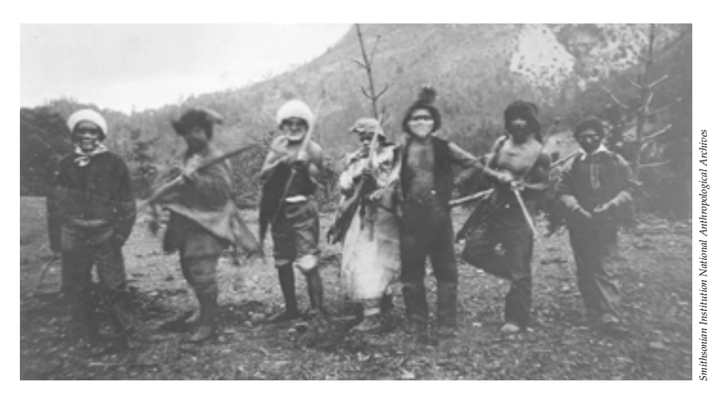
THE LAST WINNEMEM WINTU WAR DANCE WAS IN 1887.

The majestic bird glided by, tilted its wings and looked straight toward the fire and the dancers. I saw its yellow eye flash in the sunlight.