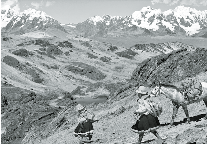
IN THE ANDES OF PERU, Q'EROS PILGRIMS JOURNEY BELOW MT. AUSANGATE ON THEIR WAY TO THE Q'OLLOY RITI CEREMONY.

At 3AM we gathered outside our tents in frigid thin air under a full moon and began our slow hike up to the glacier. It was a long walk. Peru's glaciers have lost 25% of their mass since 1970. As the